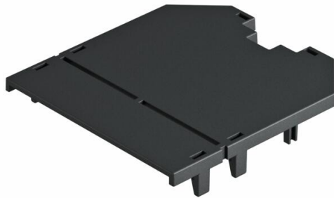
Plate can be reduced to 61 mm as required.

Cover plate, blank, for closing off unused installation space of the UT3 universal support.